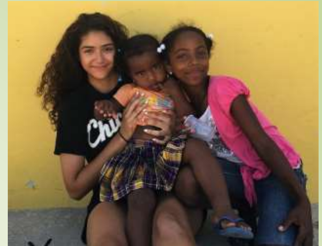
Anahi traveled to the Dominican Republic where she provided community service in local health clinics – and made friends!

-- On the cover: Sparkle traveled to Tanzania where she engaged in community service and enjoyed bonding with local children